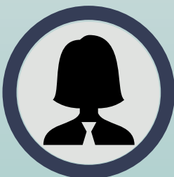
Jacqueline Iny Business Transformation Dir. AECOM

S&P Global will provide a Canadian and USA perspective on the market outlook. There is a delicate balance between the energy transition and energy security. What will this look like? The session will identify and discuss the key signposts affecting investment decisions and actions within the industry.